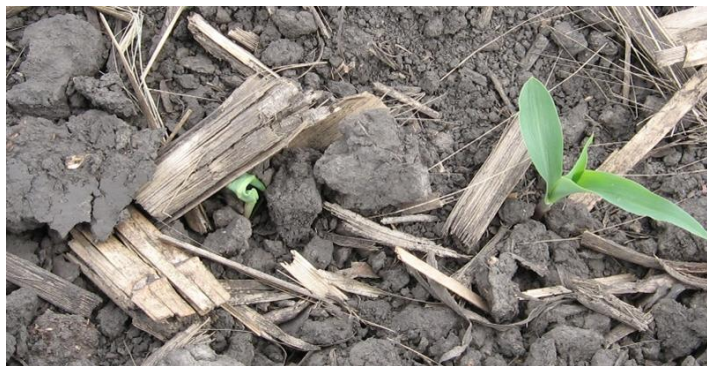
Figure 3b. Premature rupture of the coleoptile and 'leafing out' may look like a 'shepherd's crook' (3a) and can be caused by crusted soil and chilling injury.

Cloddy or Sandy Soils. If the coleoptile senses light, the mesocotyl is signaled to stop elongating. This normally occurs when the mesocotyl is approximately 3/4 inch below the soil surface. Cloddy, dry, or sandy seedbeds can allow light to hit the coleoptile when the mesocotyl is more than 3/4 inch below the soil surface. The leaves continue to expand below the coleoptile causing it to rupture. The exposed leaves then struggle to penetrate through the soil for successful emergence.