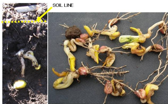
Figure 2. Under conditions such as prolonged exposure to cool soil temperatures, the mesocotyl can grow abnormally resulting in premature rupture of the coleoptile and leafing out below the soil surface.

Emergence. Visual signs of germination include swelling of the seed, elongation of the radical, then growth of the coleoptile. 1 Roots grow down and the shoots (the coleoptile and mesocotyl) grow up due to geotropism, which is plant growth in response to gravity. The coleoptile is a shield that protects the contained seedling leaves as the shoot is pushed through the soil due to elongation of the mesocotyl, which is the white internode tissue between the seed and the coleoptile (Figure 1). When the coleoptile senses red wavelength light, plant hormones sent from the coleoptile to the mesocotyl are altered, halting growth of the mesocotyl. The coleoptile normally senses light approximately 3/4 inch below the soil surface.