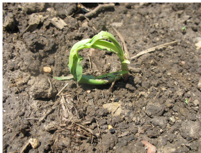
Figure 3a. Shepherd's crook.

Soil Compaction and Sidewall Compaction. Physical restriction from compaction, including sidewall compaction, can result in coleoptile damage or inadequate elongation of the mesocotyl.